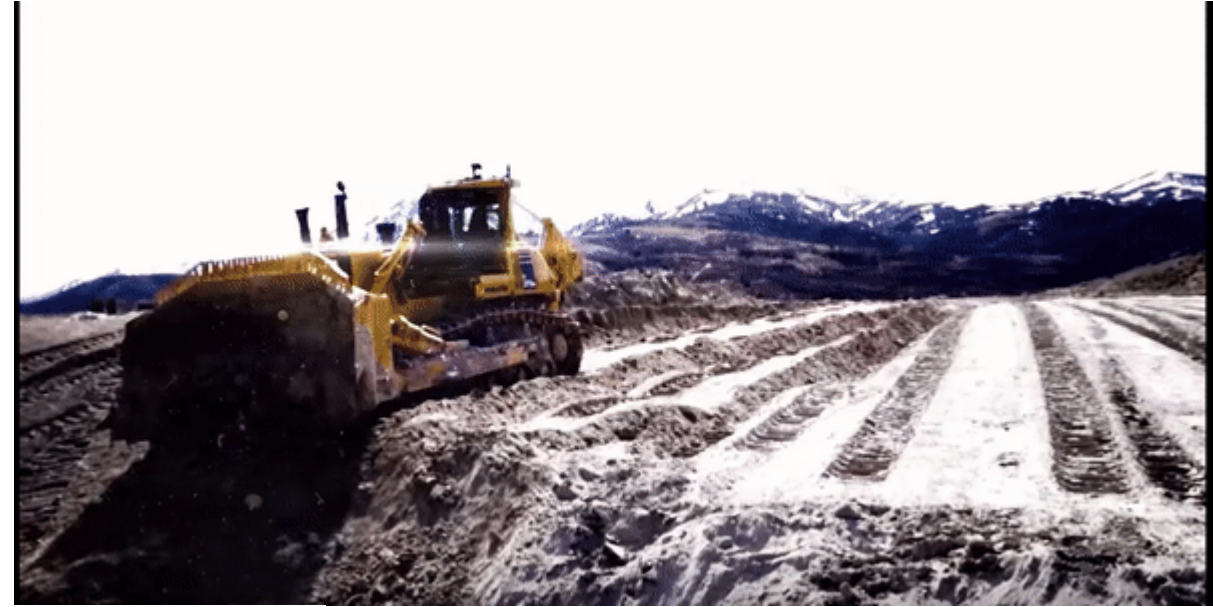
Bingham Canyon Mine