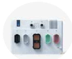
VEHICLE CONTROL UNIT